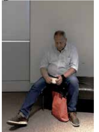
A welcome cup of coffee at the end of the day.

I urge every FIDEM member to try to get to one of the Congresses. You won't be disappointed. Each congress has its own flavor and special events but it is the people who make it so wonderful. There is a camaraderie amongst the members who attend. The friendships formed continue on long after the Congress's. The sharing of ideas and techniques is invaluable.