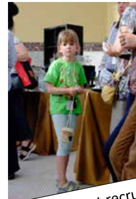
FIDEMS youngest recruit