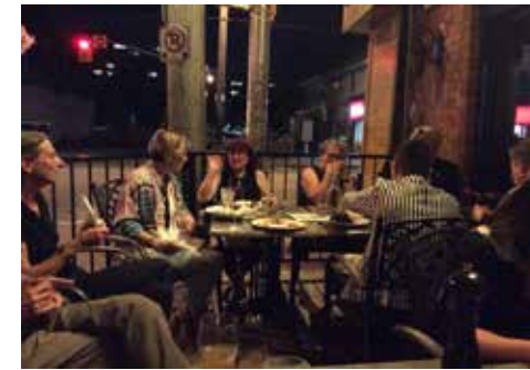
Friends gathering in the evening after the daily program