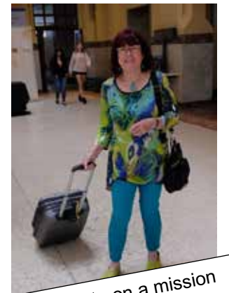
A delegate on a mission