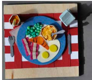
Daria Shepelenko Breakfast (with milk Container)