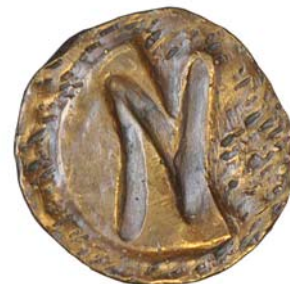
Natasha Dover The Eye Dreams (Reverse)