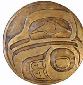
Paul Bentzen The Eagle (Obverse)