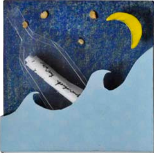
Svelana Kassatkina Message of the Sea