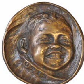
Doris Purchase Otis (Obverse)