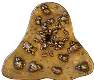
Shirin Diranbeigui Freedom (Reverse)