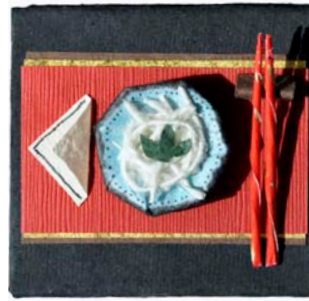
Rhys Davis Noodles