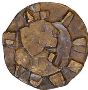
Cassandra Cabral-Berbatiotis Om Nom (Reverse)