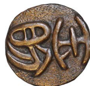
Yu Pan Wang Butterfly (Reverse)