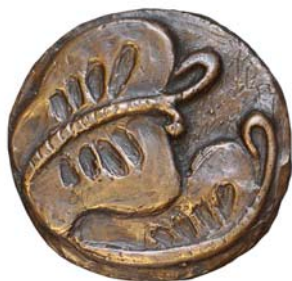
Yu Pan Wang Butterfly (Obverse)