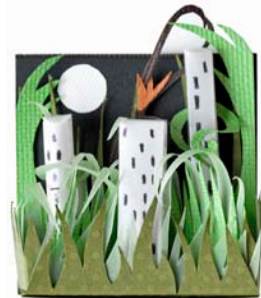
Heather Stokes Salvage