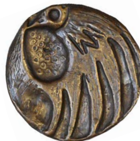
Soojin Chung Morning Rise (Obverse)