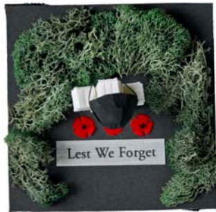
Jeff Close Less we Forget