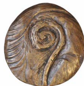
Doris Purchase Otis (Reverse)