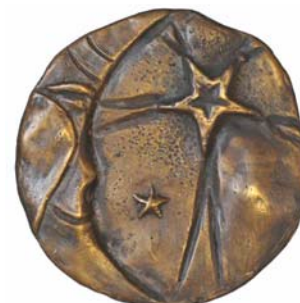
Terra Martin Primitive Passion (Reverse)