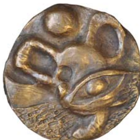
Natasha Dover The Eye Dreams (Obverse)