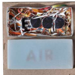
Wayland Gill Food, Air, Art, Design