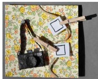
Linzie Hunt Picture This