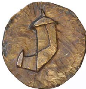
Cassandra Cabral-Berbatiotis Om Nom (Obverse)