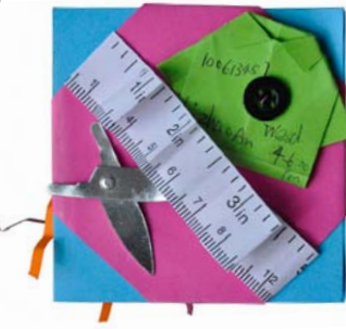
Li Zhoa An Sewing Kit

For further information about the courses, please contact: Lorraine Wright lwright@georgebrown.ca