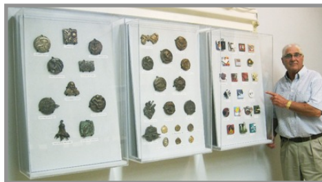
Art Ellis in front of the student display at Rodman Hall

We also wish to thank Art Ellis for curating the show, ensuring an excellent display.