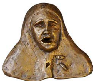
Shirin Diranbeigui Freedom (Obverse)