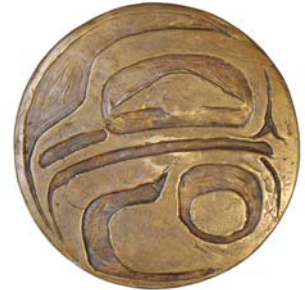
Paul Bentzen The Eagle (Reverse)