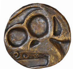
Soojin Chung Morning Rise (Reverse)