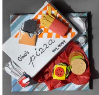
Brigitte Kovacs Untitled (Pizza Box)