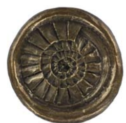
Emmeli-Sue Klumpenhower It Looks Scary ...